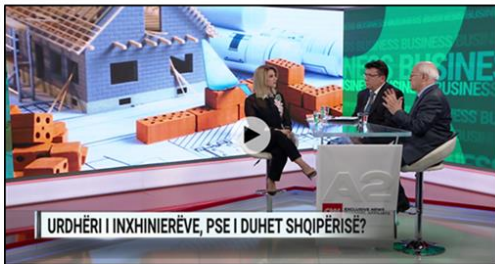
(Video News) Order of Engineers, why does Albania need it?