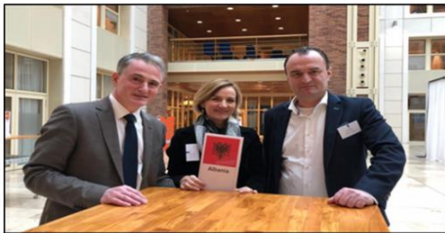
Diaspora Business Chamber on Business Dialogue at Balkan Conference in Hague