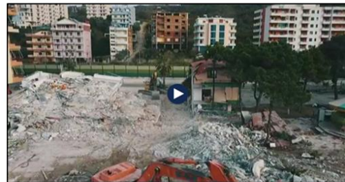
(Video News) After the earthquake less taxes / Damaged businesses will benefit