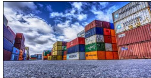
Coronavirus postpones business investment by two months, impacting GDP decline